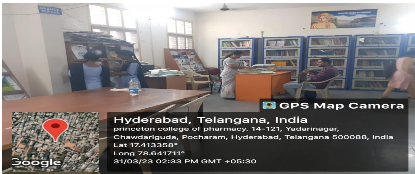
Library reading hall with plenteous infrastructure and resources (Main Building)